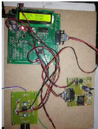
Fig.3.1. Hardware kit.

A considerable variety of extracting team are trusted to function under unbelievable problems as revealed by the improvement fundamentals, and also a couple of excavators fall short horrendously from extracting troubles dependably. It is straight, generally, sustained that the below ground mining workouts are of high danger. In the context of this, a seeing and also control framework should be sent out as one essential facility keeping in mind the supreme purpose to make sure the mining safety and security and also motivate unique projects. All the same, below ground coal digs typically consist of optional locations as well as branch areas, as well as this jumbled framework makes it especially challenging to hand down any kind of structures company skeletal system.