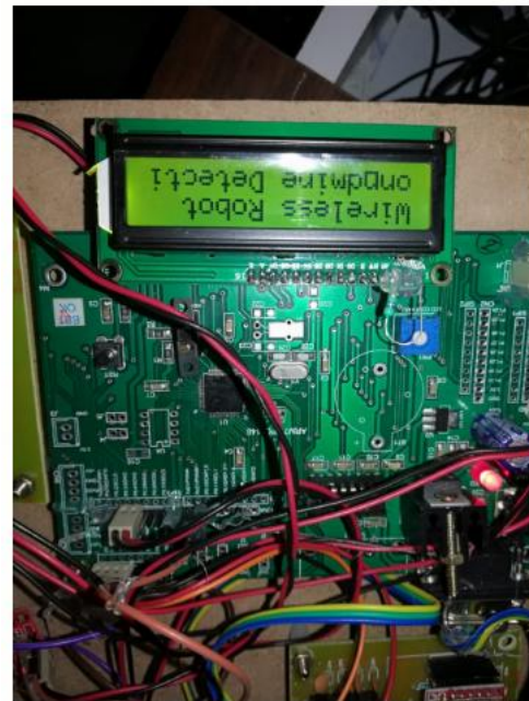
Fig.3.1. Working model.

unit to be as light-weight as viable, however, its passage over the mine earlier than detecting it will reveal it to excessive risk. Hence, the metal detector is steady on the bottom of a plastic arm this is linked to the side of the auto to come across the mine in advance than the arrival to its place. The GPS guard is likewise related at the pinnacle of the arm so the vicinity of the detected item is what to be despatched to the number one unit and no longer that of the auto.