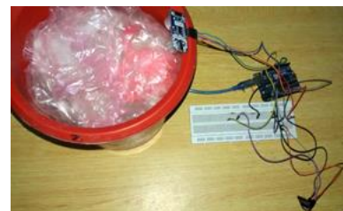
Fig.4.1. Hardware kit image.

The essential objective of our project includes making use of IoT technology (electronics and applications) to the modern-day urban waste control situation and allows a two manner conversation a number of the infrastructures deployed within the town and the operators/directors. A centralized gadget for real-time monitoring is our purpose to accumulate. In this way, both the municipal and citizens gain from an optimized machine which leads to foremost fee savings and much fewer city pollutants.