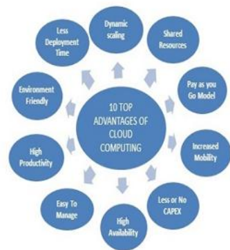
Figure 1: Benefits of cloud Computing.