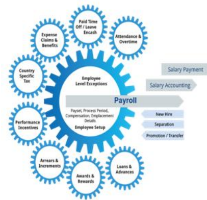
Figure 2: Payroll functionalities.

providing Payroll HRM package with security standards like ISO 27001 as well as SSAE 16 and ISAE 3402.